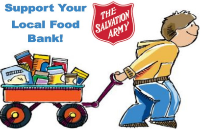
Fill-A-Bag Campaign 2018

Volunteers are needed to help us staple the instruction sheet to the paper donation bag, so that they are ready for the teams to distribute at the end of November. Please sign up in the foyer so that Susi knows how many muffins to get. If you have a stapler, please bring it along too.